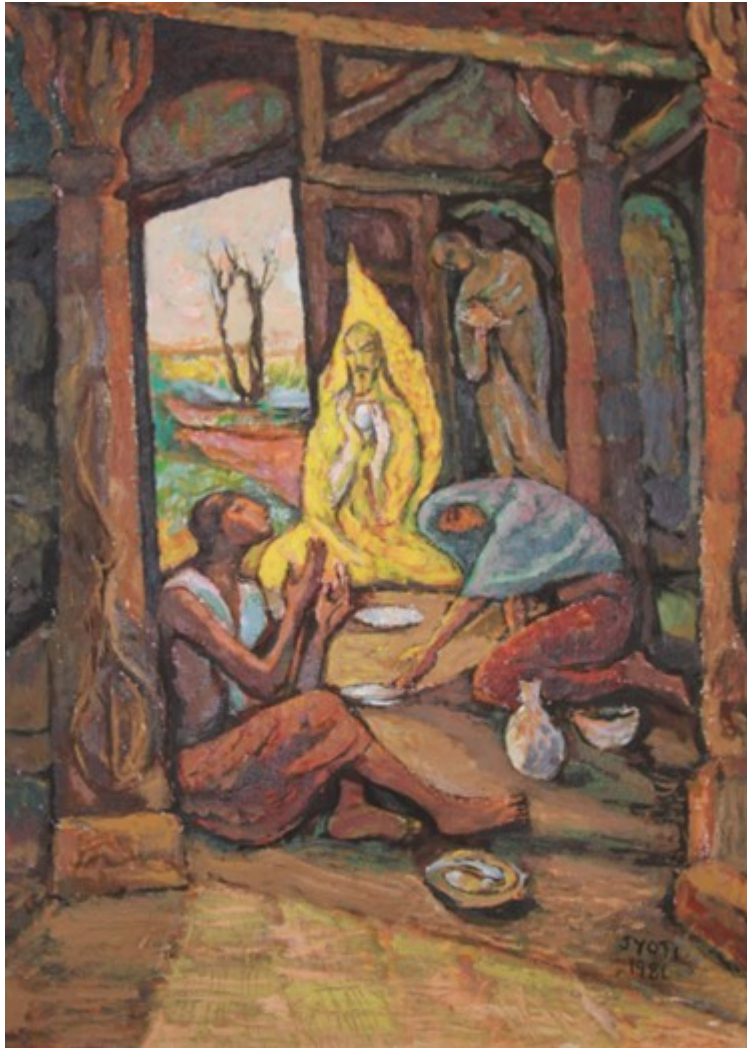
Jyoti Sahi, "The Supper at Emmaus," 1980