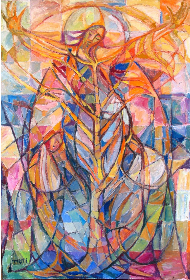
Jyoti Sahi, Resurrection (2007)