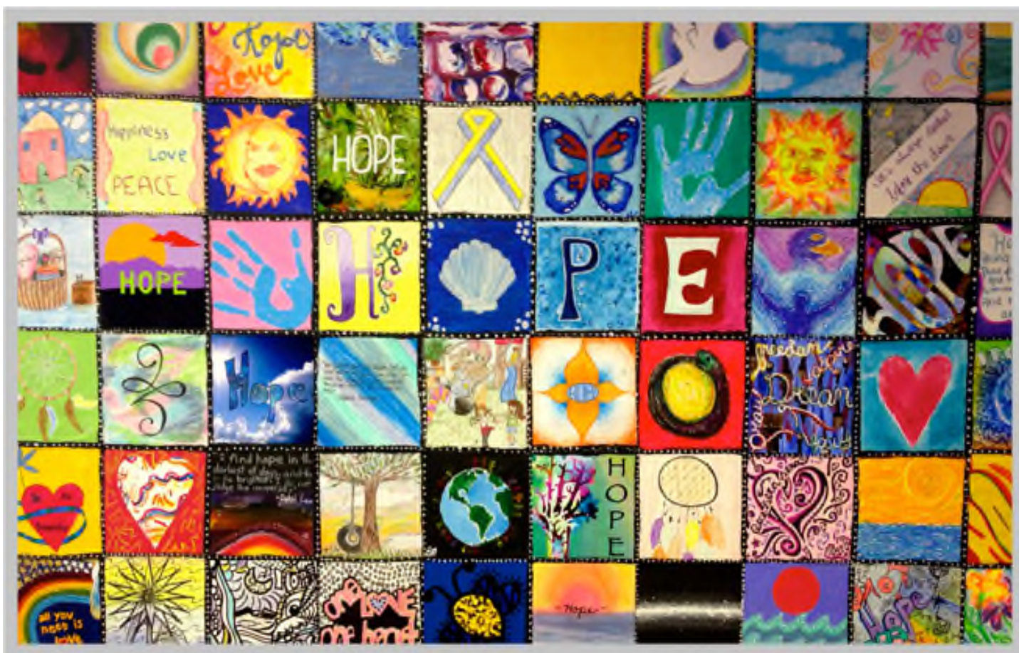
“Hope Project,” by juniors and seniors at Barnstable High School (Hyannis, MA)