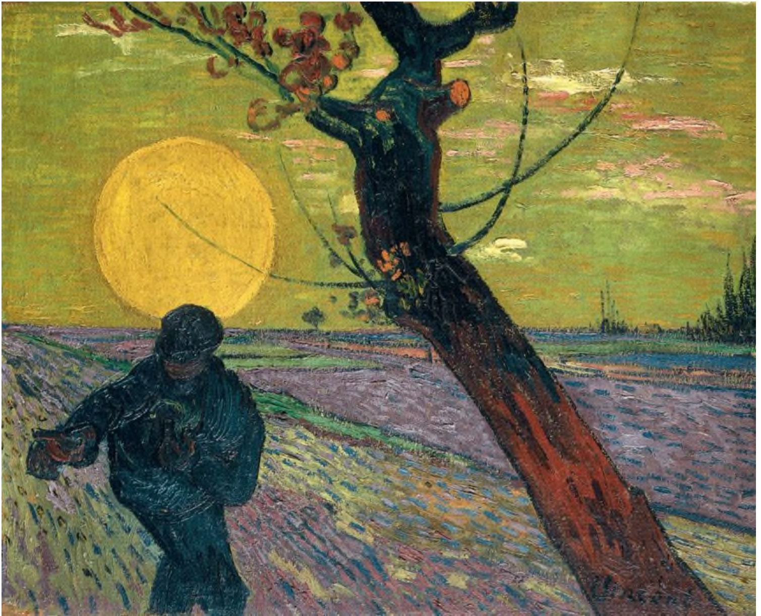
"The Sower At Sunset," 1888 by Vincent Van Gogh