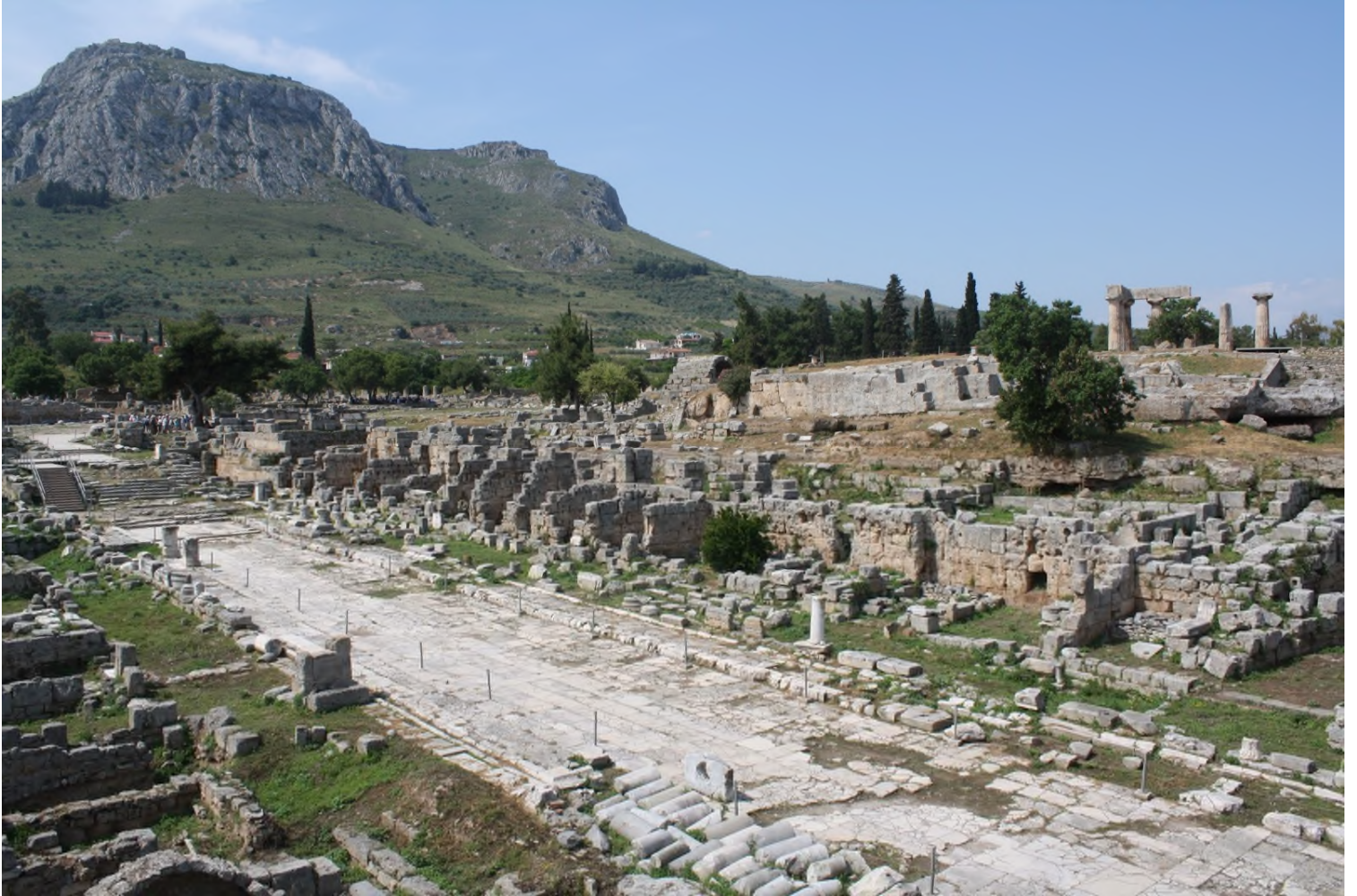
Ruins of the ancient city of Corinth, located in modern-day Greece, the place where Paul first met Aquila and Priscilla, fellow Jews and tent-makers, in the mid-first century AD