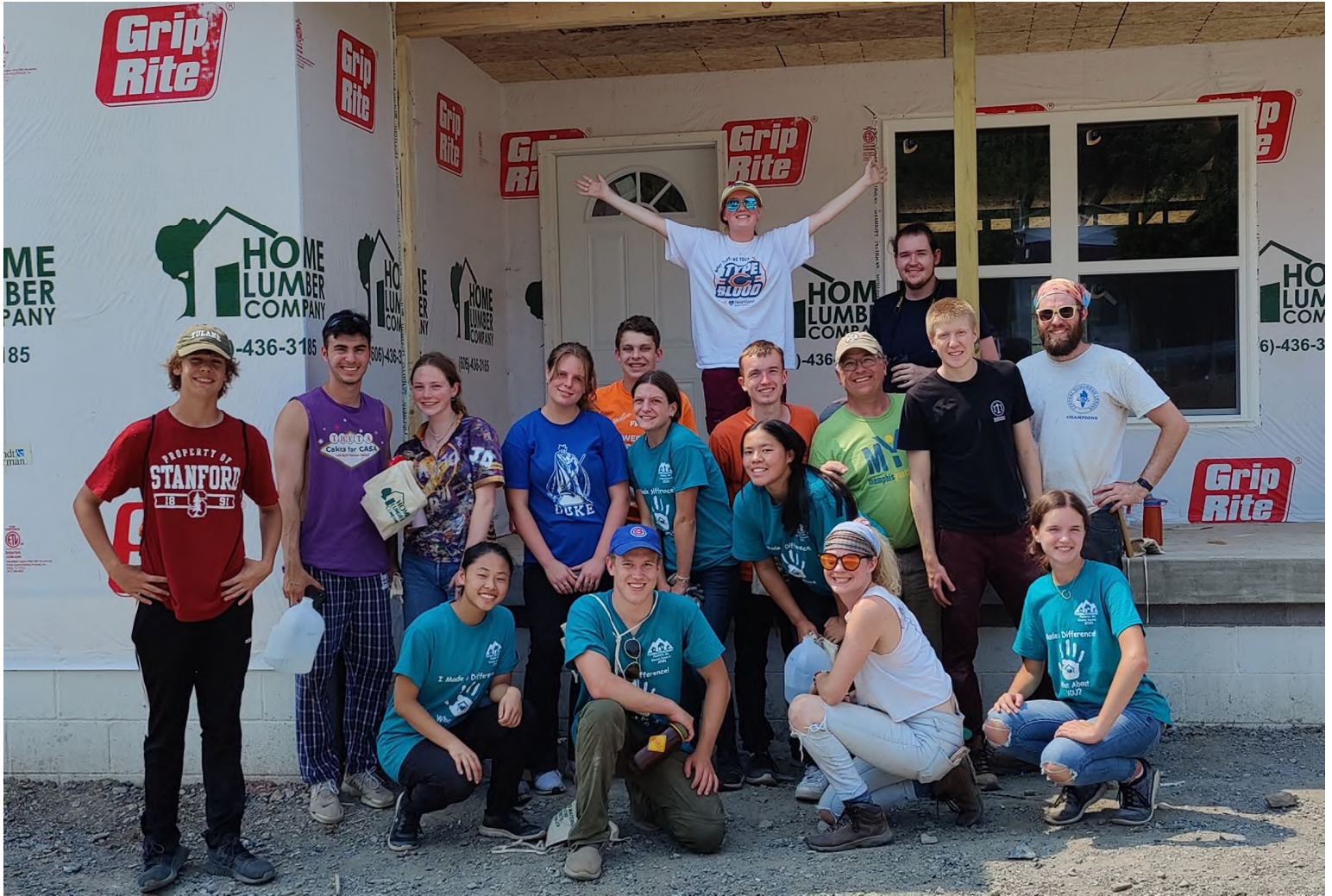
Our Tower Youth at their work trip site in Hazard, Kentucky.