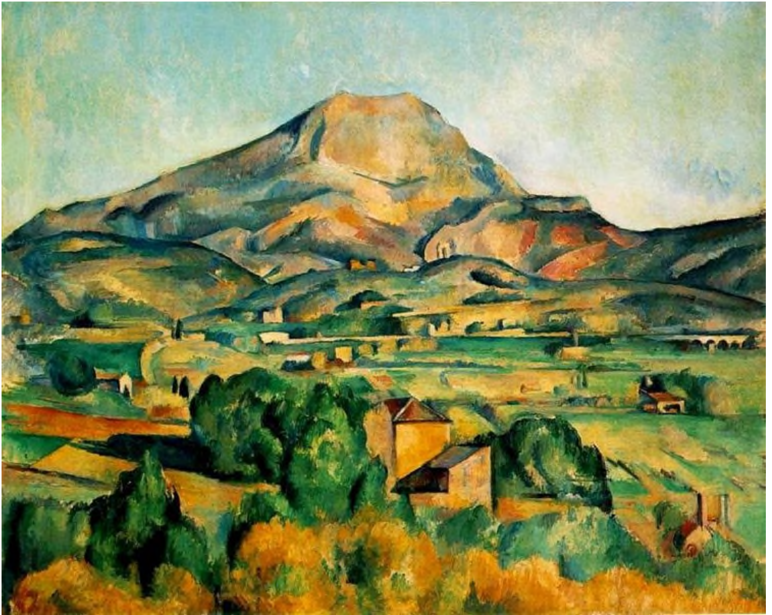
Paul Cezanne, "Mont Sainte-Victor," 1895